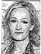
ROWLING: Magic touch

A spokesman for the high street retailer Waterstones said: "It is