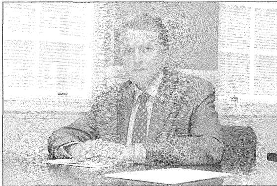
LEADING THE PANEL: Sir Christopher Meyer, chair of the Press Complaints Commission

That is all for this month, but as always if you are dissatisfied by the way the editorial staff have dealt with a complaint you can contact me and I will investigate and take it forward on your behalf. I can be contacted in writing at The Star or by email at ombudsman@eveningstar.co.uk