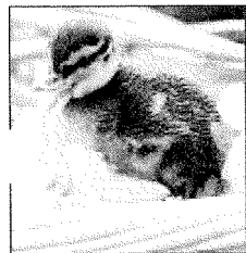
RESCUED: But four of the ducklings found have died.

FIVE hundred people have so far found paid work through a Nottingham City Council jobs scheme. The council's Future Jobs Fund aims to create about 1,000 posts. More vacancies will be on offer at a jobs fair in the Council House today from 10am to 3pm. Employers from across the city will be on hand to offer help and advice to job seekers.