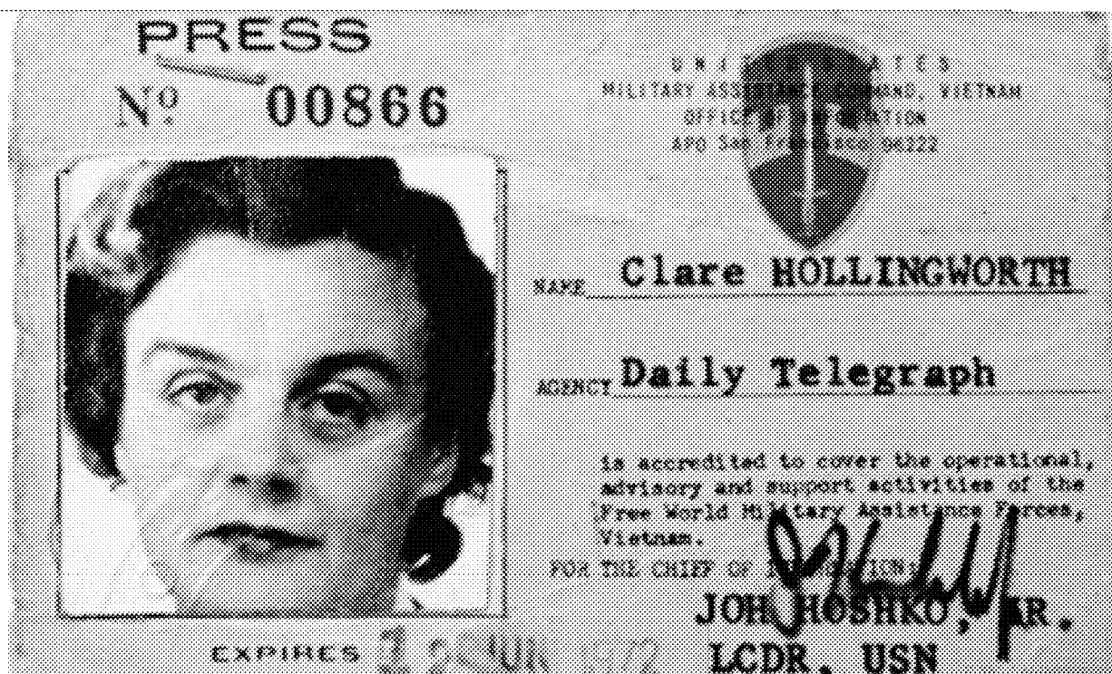
Historic example of future Paul Dacre backed system.

Paul Dacre came to the Leveson inquiry with ideas. Some of which we got to hear, although Robert Jay had three hours of questioning to get through. And if anybody else had proposed them, they would have been ... well, dismissed almost immediately. But this is Paul Dacre, and if the Mail editor-in-chief has an idea, we all ought, at least, to take him seriously. Who knows, we might agree after all.