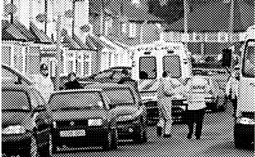
A heavy police presence in Foxton Road, Alum Rock. Click enlarge to see a map of the areas where arrests took place

The victim would have been made to plead for his life to Tony Blair, denounce the war and ultimately be executed - all on film.