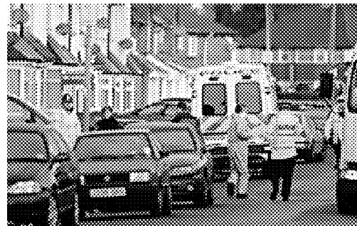
A heavy police presence in Foxton Road, Alum Rock. Click enlarge to see a map of the areas where arrests took place

The victim would have been made to plead for his life to Tony Blair, denounce the war and ultimately be executed - all on film.