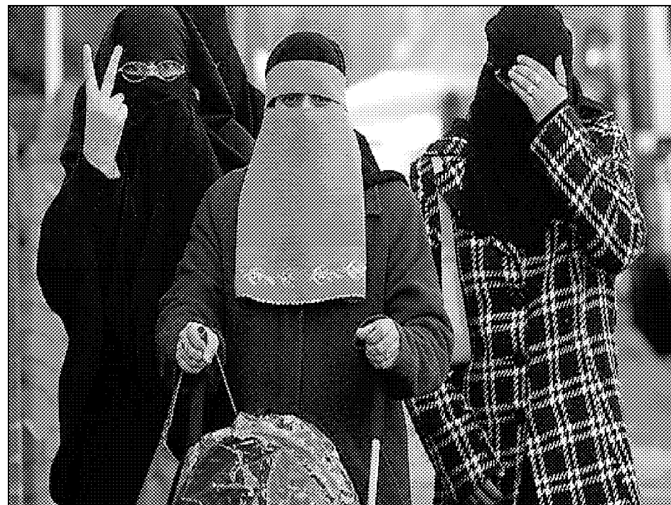
Example of community pic in national media.